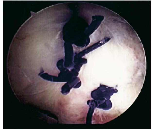
FIGURE 4. This final arthroscopic view from the midlateral viewing portal shows complete closure of the rotator cuff defect with the placement of 3 side-to-side No. 1 PDS sutures.

with a poor result has failed subsequent open repairs as well.