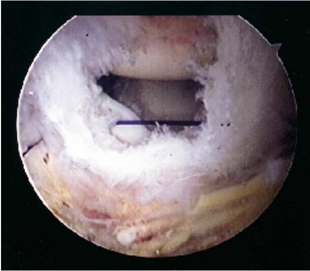
FIGURE 2. This arthroscopic view through the midlateral subacromial viewing portal shows the passage of a No. 1 PDS suture from posterior to anterior through a long crescent-shaped suture passing hook (Linvatec, Largo, FL) through the apex of the U-shaped tear.

more satisfied with their side in which the purely arthroscopic repair was performed and had a perception of a quicker period of recovery and return to function than with their open repair. The 1 patient