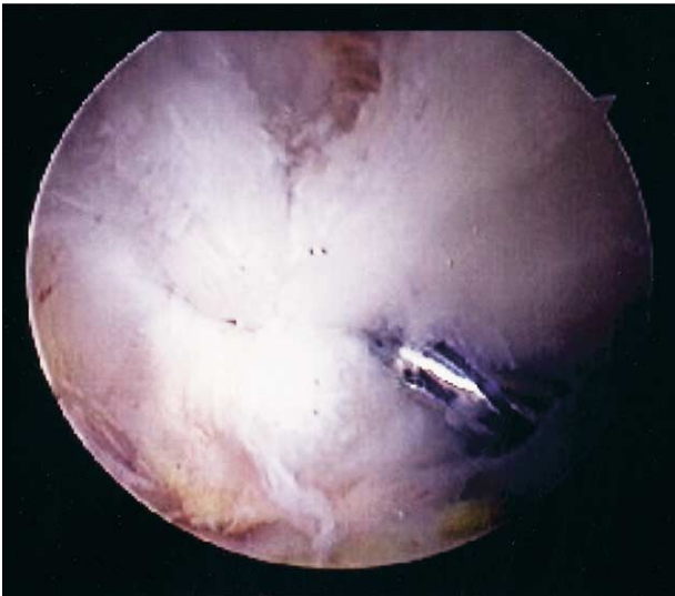
FIGURE 3. This image again through the midlateral subacromial viewing portal shows the effect of this initial suture placed through the apex of the previously large-appearing U-shaped tear. The arthroscopic knot pusher is shown securing the initial Duncan sliding knot of the single suture that was seen in Fig 2. Note the effect of this single suture on closing the remaining defect.

more satisfied with their side in which the purely arthroscopic repair was performed and had a perception of a quicker period of recovery and return to function than with their open repair. The 1 patient